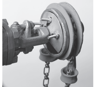
CL4 back view