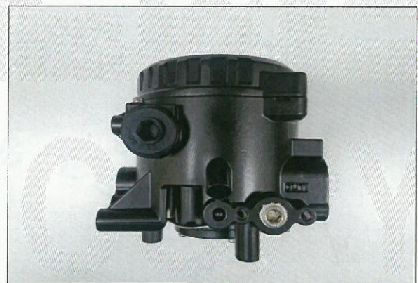
[Fig. 2: Side]