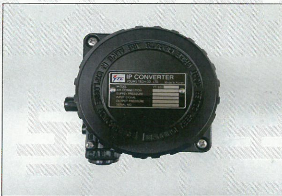
[Fig. 1: Front]