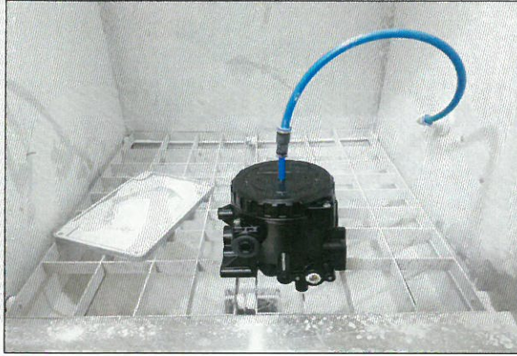
[Fig. 3: IP 6X]