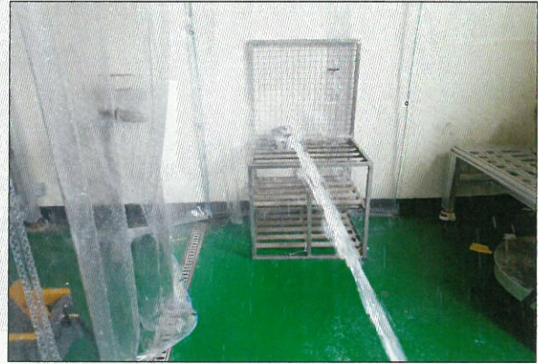
[Fig. 4: IP X6]