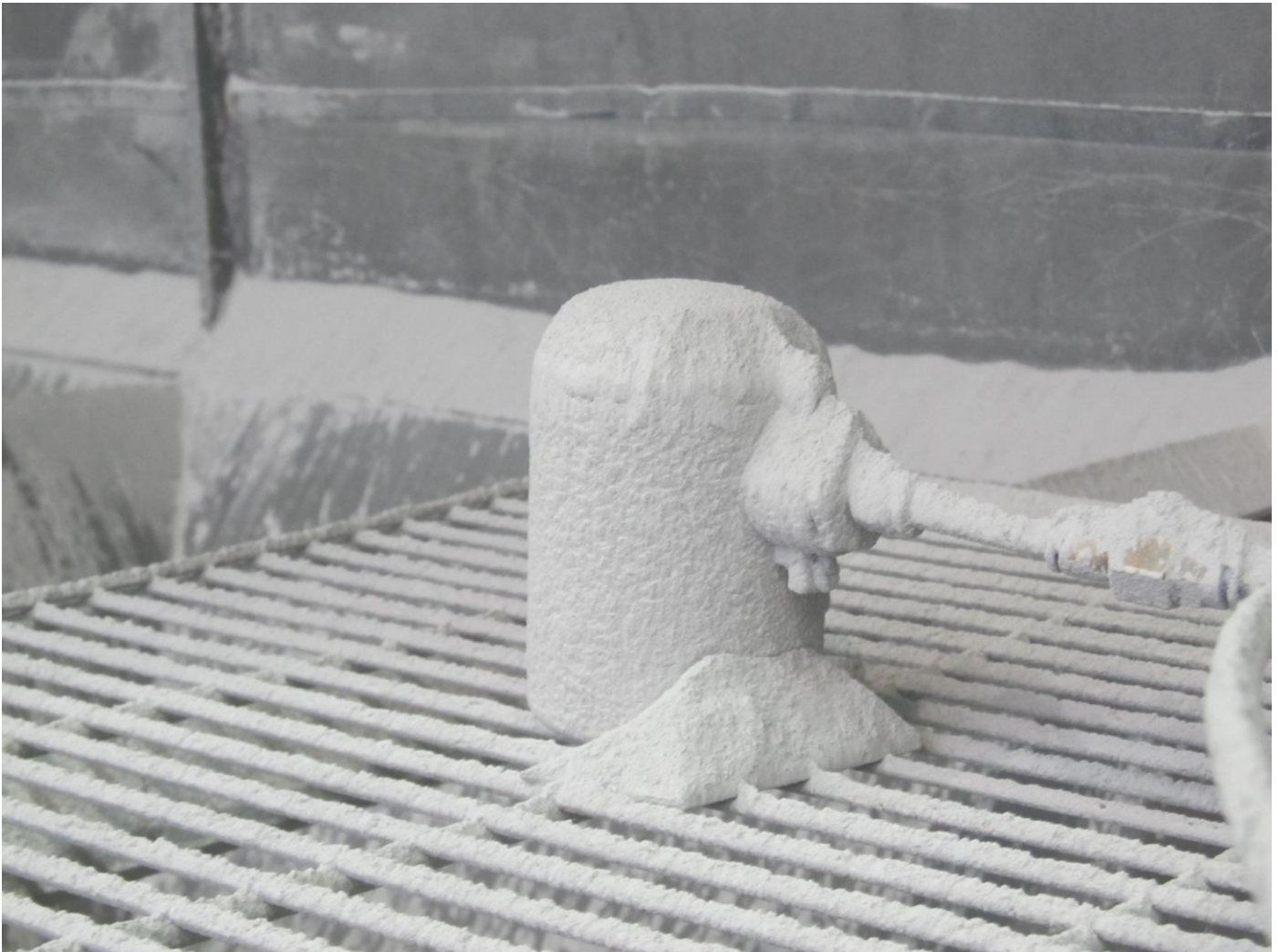
SPECIMEN MOUNTED IN DUST CHAMBER AFTER DUST TESTING