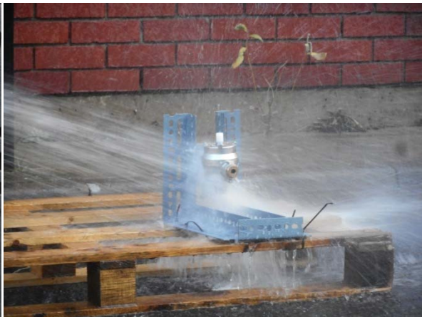
EUT Undergoing IPX6 Test Figure 2