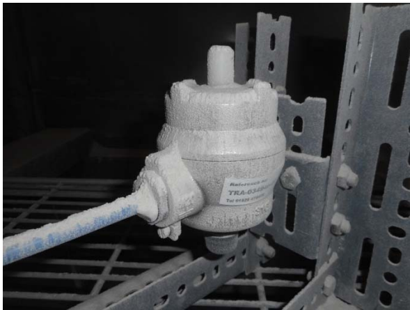
EUT Upon Completion of IP6X Test Figure 1

The EUT TRA-034946-S1 (excluding the void defined in Figure 4) therefore satisfies the requirements of BS EN 60529:1992+A2:2013, IP66 and IP67.