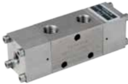
Figure 1. Example pilot operated variant 3/2 single pilot operated valve

Both the solenoid and pilot operated variants of the valves have the same principle of operation. The inlet pressure supply is connected to port 1, the outlet (actuator) to port 2 and the exhaust to port 3. With no pressure signal applied to the pilot port the valve remains in the spring extended position with the inlet supply (port 1) blocked and the outlet (port 2) connected to the exhaust (port 3). When an appropriate pressure signal is applied to the pilot port the valve internals move to the spring compressed position; this connects the inlet (port 1) to the outlet (port 2) and blocks the exhaust (port 3). Upon removal of the pilot pressure signal the valve returns to the spring extended position as previously described. It should be noted that during the transition between these two states the valve is open centre (all ports connected).