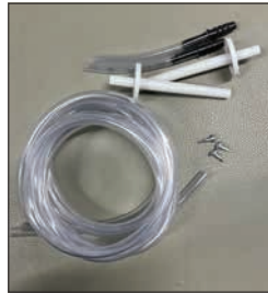
Installation Kit-2-Cos/Bin-P, Reg-V