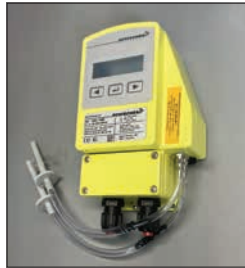
Cos/Bin-P, Reg-V with connection set