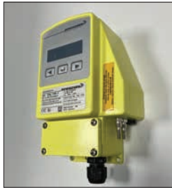
Cos/Bin-P, Reg-V Standard