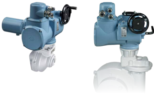
CK actuators plus Rotork second stage gearboxes

Thrust base types are separate to the gearcase allowing easy installation. Should the actuator be removed, the base can be left on the valve to maintain its position. All base dimensions and couplings conform to attachment standards ISO 5210 or MSS SP 102.