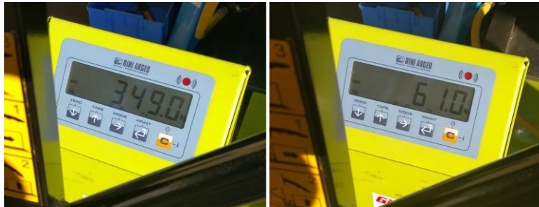
Figure 3: Water volume before and after test.

After the test, there were 61 liters left, which means that 288 liters have passed in the test (Figure 3). Split in 3 minutes will be 96 l/min.