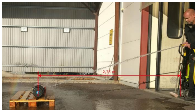
Figure 2: Set up and spraying distance.

A tank was filled with 349 liters of water and pressurized to 2.5 bar, the water flowed at about 100 liters per minute (l/min) for three minutes. The size of the nozzle was 12.5mm diameter, according to Figure 6 of SS-EN 60529. The distance between the nozzle and the actuator was approximately 2.75 meters (Figure 2). The actuators were sprayed from all practical areas, and focusing on the sealing surfaces (Figure 1).