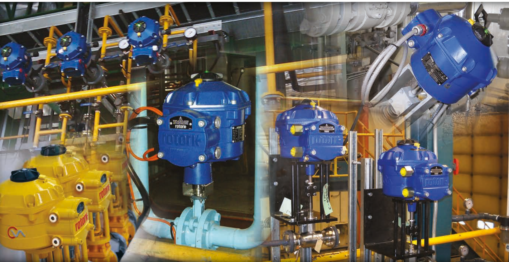
Linear and Quarter-turn Control Valve Actuators