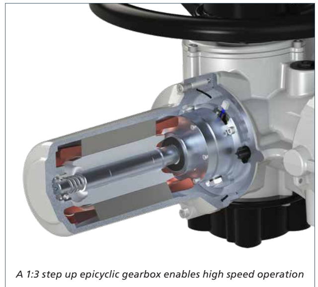
A 1:3 step up epicyclic gearbox enables high speed operation

IQH actuators have been developed for diverter valves in meter prover applications that require fast operation with positive seating and zero backdriving.