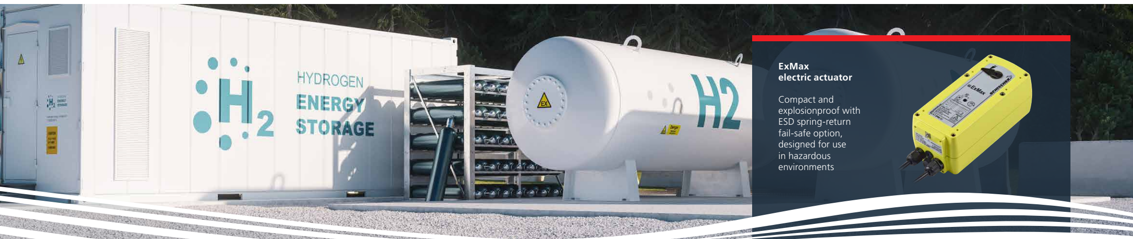
ExMax electric actuator

Rotork products are designed and engineered to very high performance levels. They pay for themselves many times over during their life cycles.